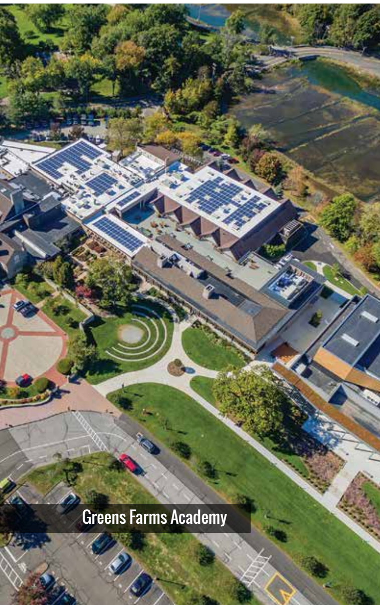
Greens Farms Academy