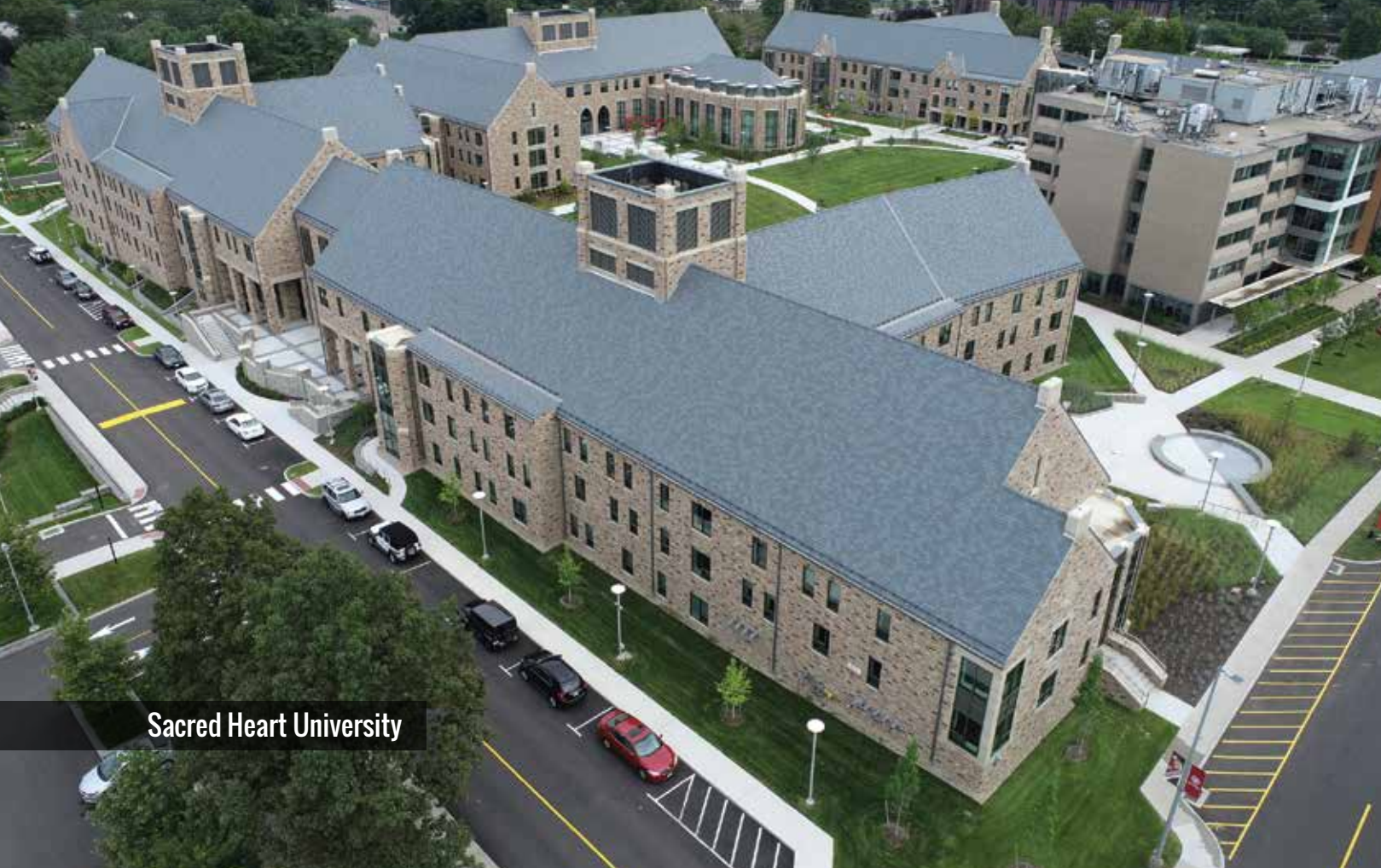
Sacred Heart University