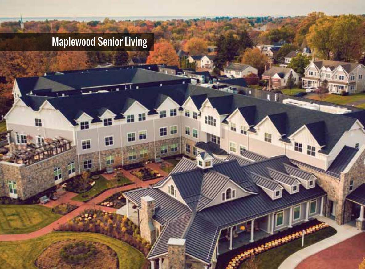
Maplewood Senior Living